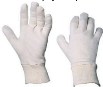
Cotton under-gloves CG-80