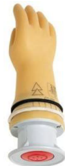
Pneumatic gloves tester CG-117