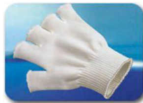
Cotton mittens CG-81