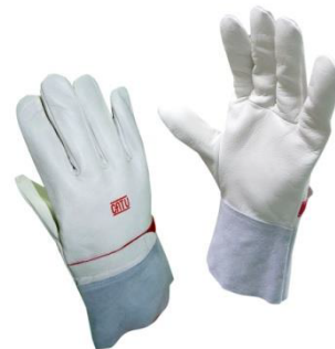
Over-gloves CG-981 for class 00 or 0