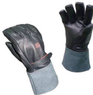
Over-gloves CG-991 For class 1 to 4